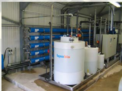
Reverse Osmosis/UV post treatment for potable reuse

The intensive aerobic environment created in the bioreactor combined with the high relative sludge age means that a high quality final effluent can be achieved in a much smaller 'footprint'. The ultrafiltration biomass separation system also provides a permeate suitable for feeding directly into the RO/UV post treatment stage. The AMBR treated effluent is suitable and reliable for watercourse discharge and RO treated water for factory reuse is blended with town's water and is fully compliant with requirements of Water Supply (Water Quality) Regulations 2000 – 'wholesome' water